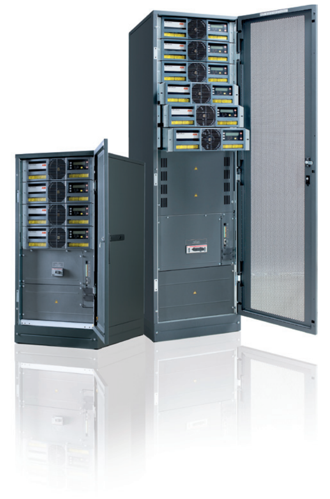
DPA UPScale ST 80